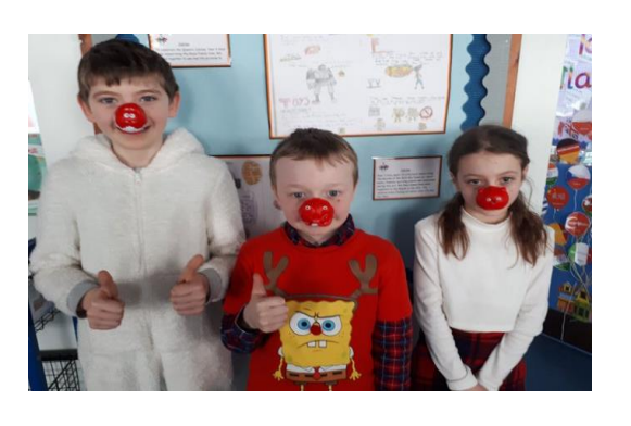
By Elise and Nepheli

Comic Relief helps by giving support and advice to those who need it. If they are scared, worried, angry or sad, these people can talk to volunteers from Comic Relief. Telling someone about their problems makes a big difference to their positivity.