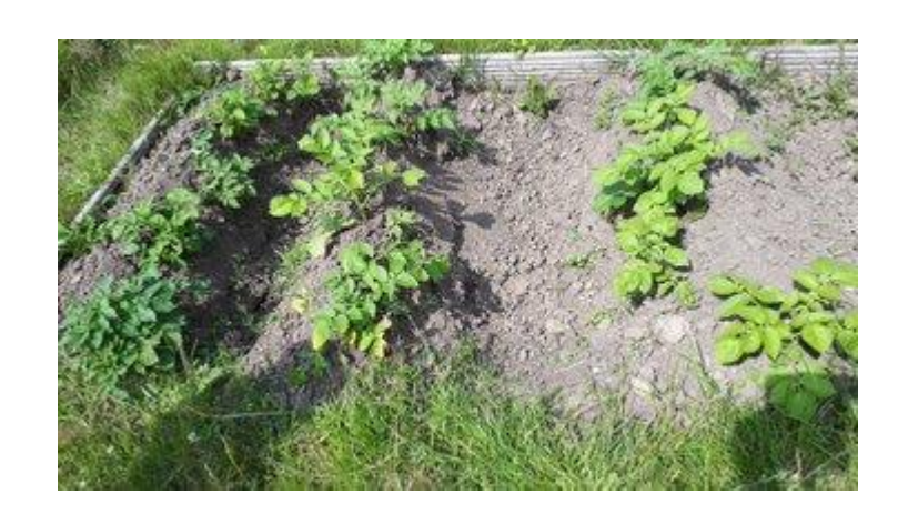
Together Everyone Achieves More